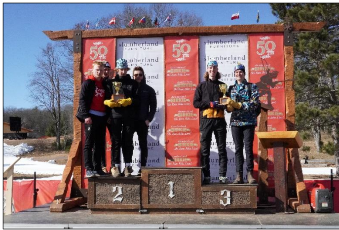
Above: 2024 Men's Collegiate Cup podium.

Five years into the league, MCSA Nordic "just seems to be getting stronger and stronger each year, with new teams making the podium and participating every race. Even the citizen racers are starting to get in on the collegiate fun, cheering for their alma mater and chatting with the teams before and after races. After years of building, it seems that the MCSA has now integrated into the Midwest Nordic culture and has made a real presence at races."