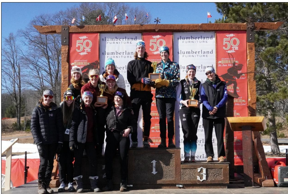
Above: 2024 Women's Midwest Collegiate Cup podium.

UMD Men's dynasty continues; SOC Women clinch first title