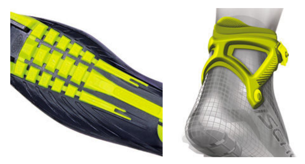
Fischer's Snake Lacing System (patent pending) and Heel Fit Strap ensure an optimum fit for every skier. The Snake lacing system is unique in that the laces only cross once, creating a continuous loop that ensures even pressure distribution around the foot. This unique lacing system combined with the Neoprene sock allows the boot to fit a wide variety of foot volumes and shapes. The Heel Fit Strap adds to the level of customization by providing added adjustability and heel hold through a strap located inside the boot.