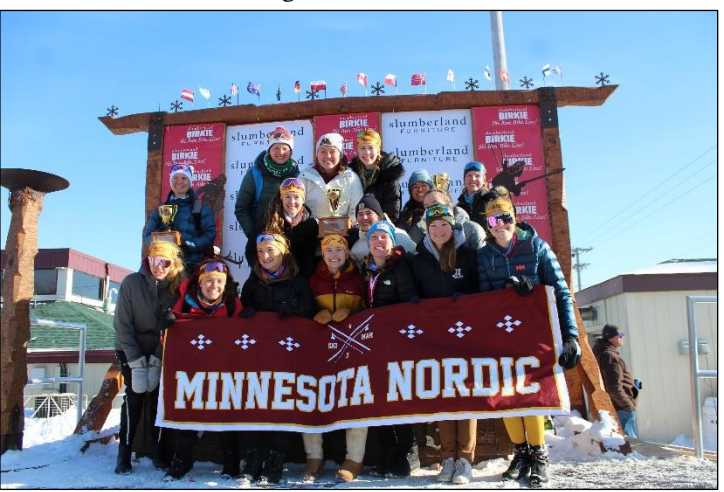
Above: The Women's Midwest Collegiate Cup podium, 2023.

Full MCSA Nordic results from Mt. Ashwabay are available <u>here</u>.