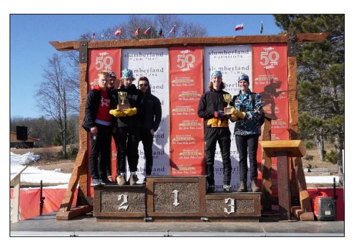
Above: 2024 Men's Collegiate Cup podium.

Five years into the league, MCSA Nordic "just seems to be getting stronger and stronger each year, with new teams making the podium and participating every race. Even the citizen racers are starting to get in on the collegiate fun, cheering for their alma mater and chatting with the teams before and after races. After years of building, it seems that the MCSA has now integrated into the Midwest Nordic culture and has made a real presence at races."