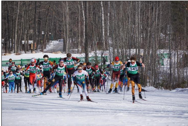
Above: Scenes from the 2023 MCSA Regional Championships in Rhinelander, WI. No Regionals event was held in 2024.