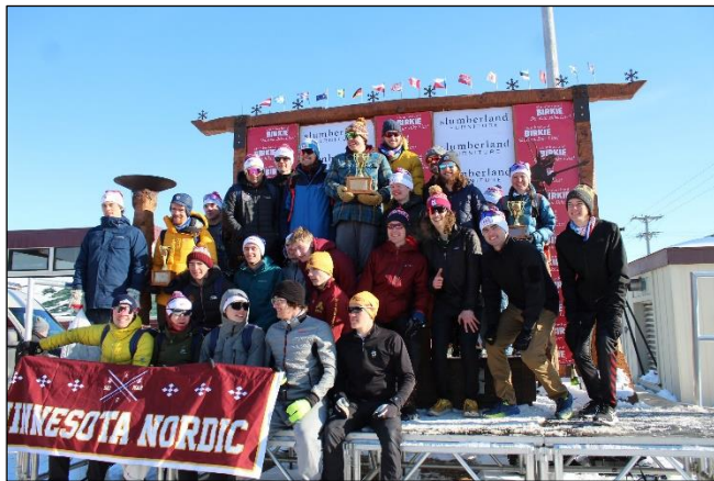
Below: The MCSA’s last appearance on the Main Street Podium, at the 2023 Collegiate Cup Finals.

Indeed, we should rest assured that “anything can”—and will!—happen as the MCSA returns to Rhinelander, Wisconsin for the 2025 Regional Championships. On Saturday, February 15 th , our skiers will compete in the first-ever Collegiate Cup Sprint , followed by a 10k Skate on Sunday, February 16 th . Points scored at Regionals will add to Teams’ cumulative Collegiate Cup totals, and qualify teams for the 2025 USCSA National Championships in Bend, Oregon , irrespective of Collegiate Cup standings.