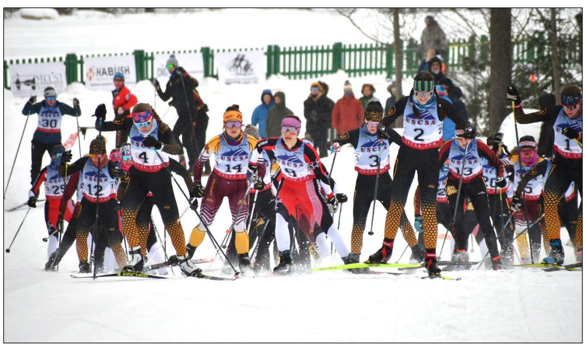
Above: The start of the Women's 10k Skate on Sunday, February 16th.

Saturday Sprint is MCSA's first-ever; SOC Women take third consecutive title; SOC Men win first Championship