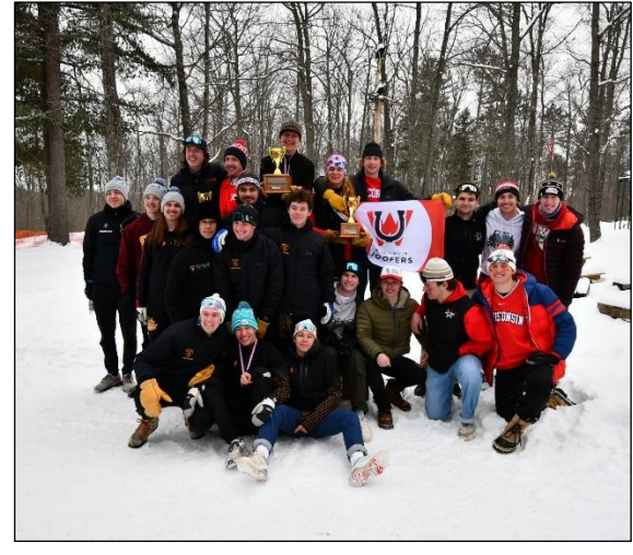
Left: MCSA Regional Championship Team Scores. Above: Men's Regional Championship Podium. Below: Women's Regional Championship Podium.