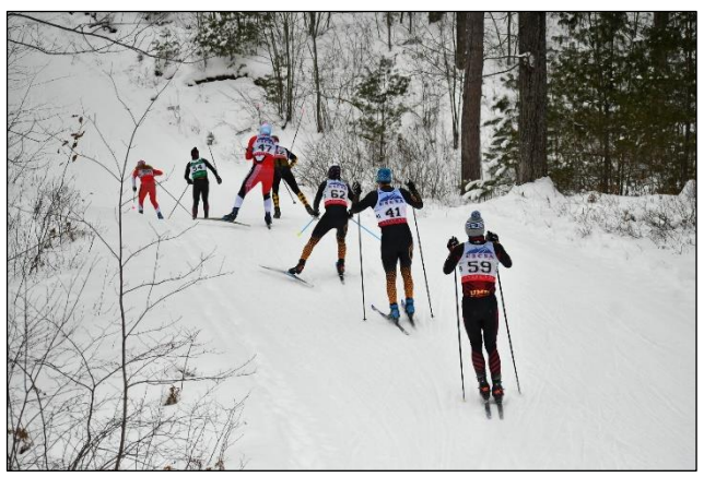
Above: Scenes from the Men's and Women's 10k Skate.