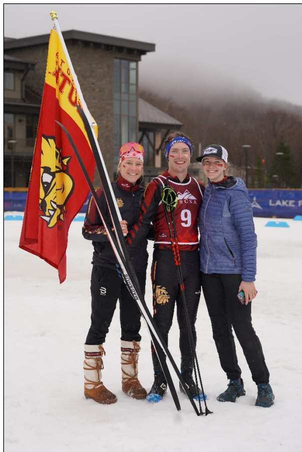
Above: UMD at the 2024 USCSA National Championships in Lake Placid, NY.