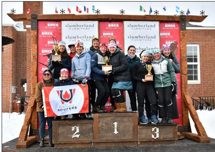
Above: The Women's 2025 Collegiate Cup Podium.

insurmountable lead in the Women's Division, and the University of Wisconsin-Madison sat comfortably in second, the University of Minnesota-Twin Cities and Carleton College stood tied for third place at Saturday's outset.