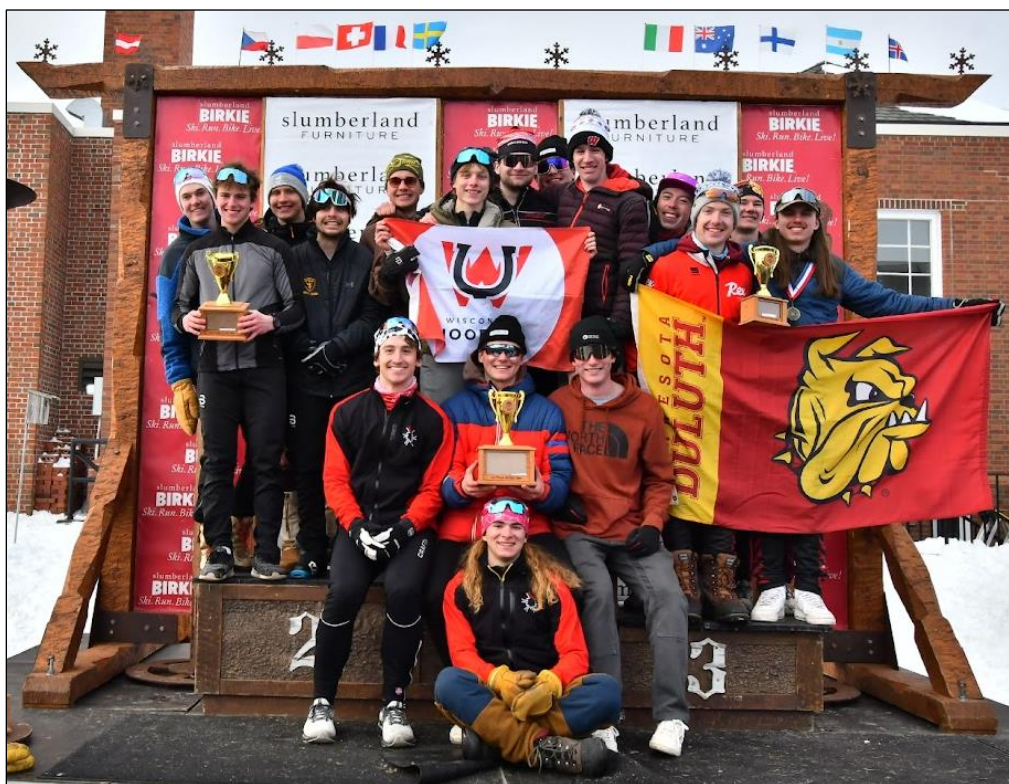
Above: Podium of the 2025 Men's Collegiate Cup.

Badger Men snatch first Cup by 10 points; St. Olaf Women storm to second title; Hubanks wins Classic Birkie & Rova second